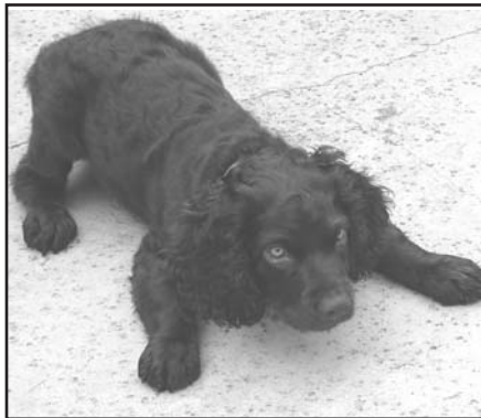
Hollow Creek's Jackson - CA