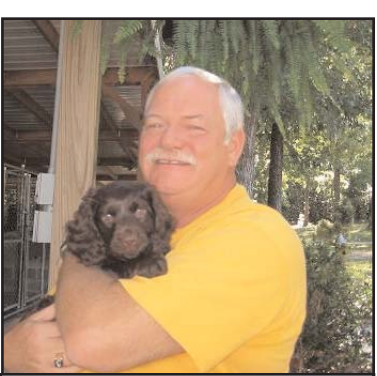
"Peaches" giving sugar to a visitor of Hollow Creek Kennels