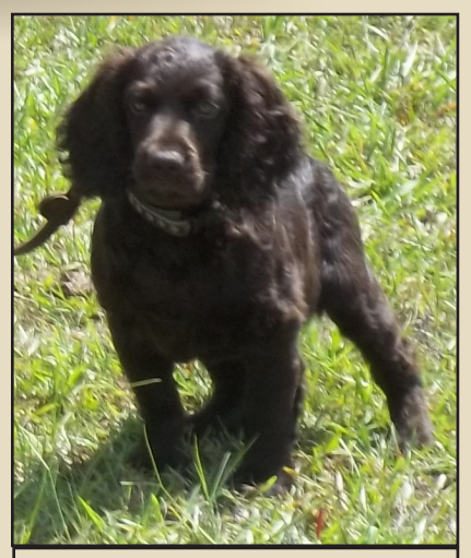
Hollow Creek's "Galliant"