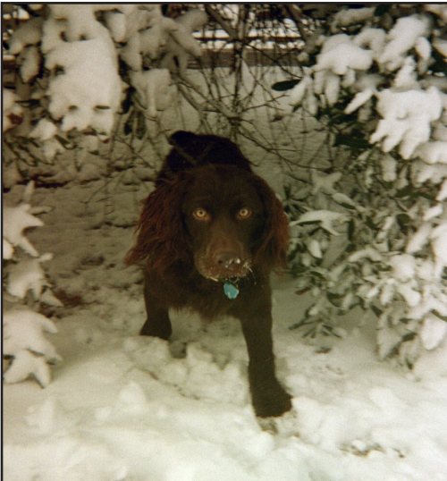
“Being a Boykin Spaniel is SNOW much fun!” - Vivian Grice, SC