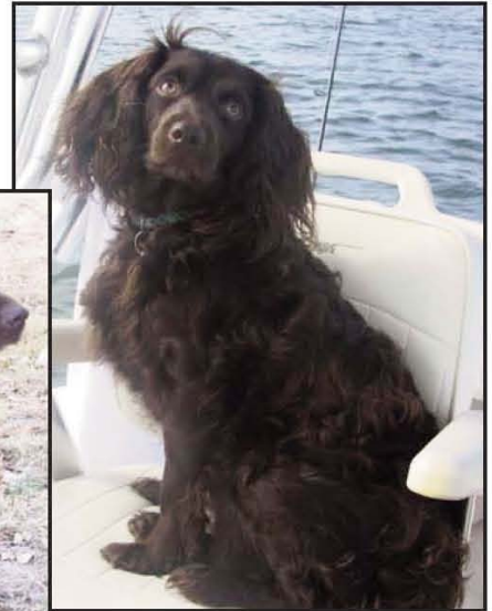
"You want me to move?!? I'm the Captain!!!"