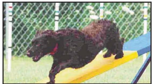
"Cara" - Harold Stanlick