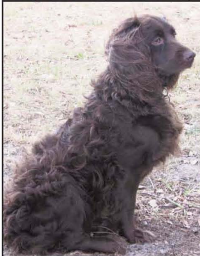
"Where did that quail go?!?"