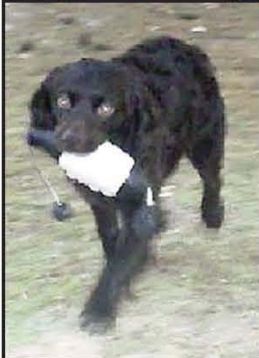
Top photo: "Cooper", Bottom photo: "Izzie"