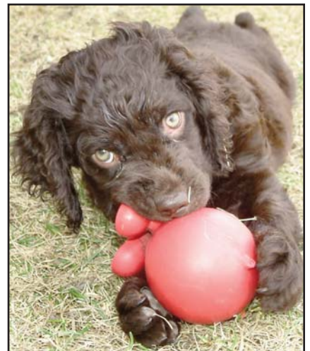
"Trapper" (8 wks. old) - Joanne Maurice, Calgary Canada