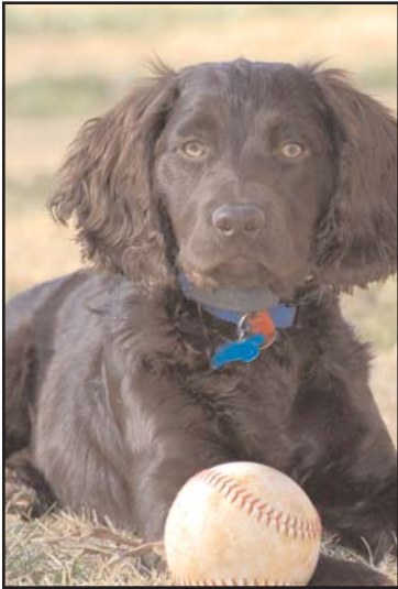
"Pippin" - One of my favorite things to watch is him in the morning looking out the back door to our deck with the anticipation of chasing the birds away from the bird feeder. It is his favorite thing to do. This is a shot we took of our dog after playing a little fetch in the back yard. (6 months old) In truth, we started out practicing T-Ball with my daughter and Pippin decided to join in by retrieving the balls after she hit them. - Andy Isley