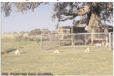
Teaching puppies to relax on the chain sets the tone for later education by showing them how to accept restraint and be content wherever they have to be.

The kind of control we do want with our puppies is leadership. Dogs, just like people, need and want to have structure in their lives. They want to belong to the pack. Puppies, just like people, want to look up to and follow a leader who is confident, efficient, consistent, and organized. This gives them a feeling of security.